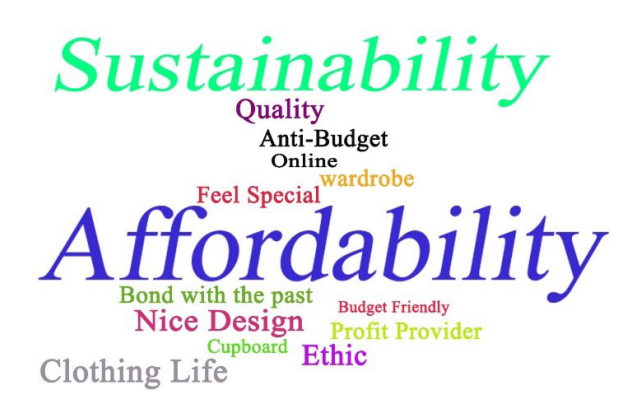
Figure 3. Word Cloud on Consumer Parties