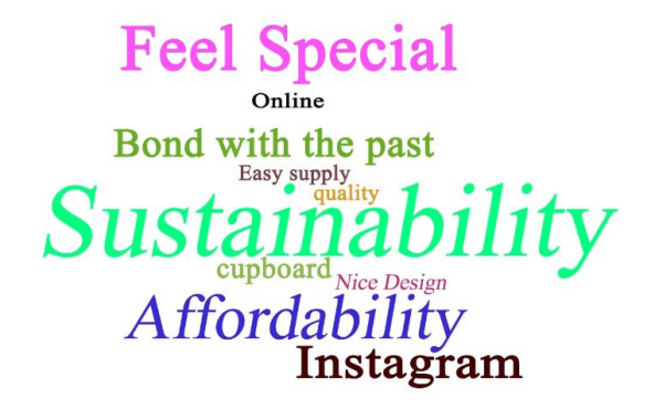
Figure 2. Vocabulary Cloud for Supply Side

As the visual expression of the frequency of use of the codes, The code cloud was created separately for supply providers and consumers, as shown in Figure 2 and Figure 3. The sizes and thicknesses of the codes in the code cloud show the frequency of use of the code.