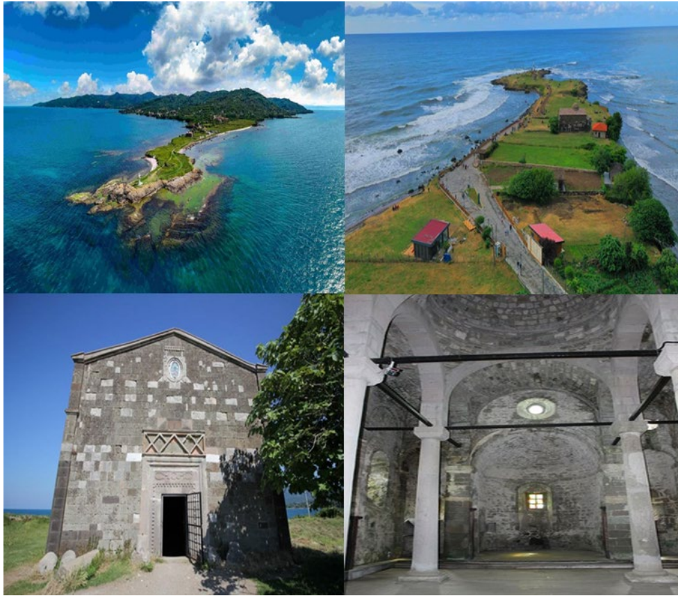
Photo 1. Photos of Cape Jason and the Church